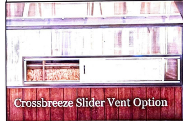
Crossbreeze Slider Vent Option