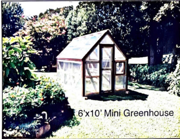
6'x10' Mini Greenhouse