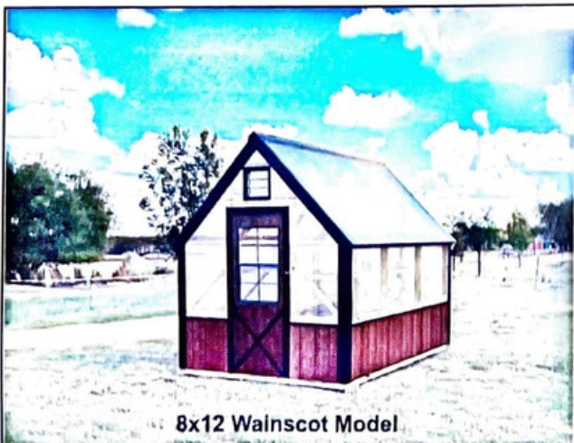
8x12 Wainscot Model