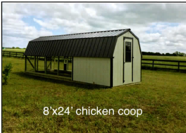
8'x24' chicken coop