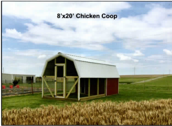
8'x20' Chicken Coop