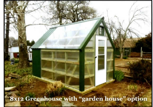
8x12 Greenhouse with "garden house" option