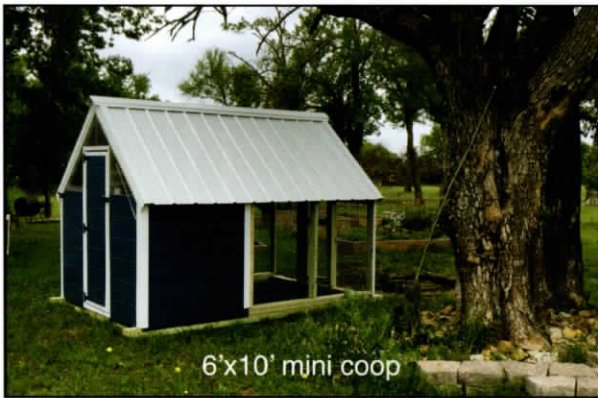
6'x10' mini coop