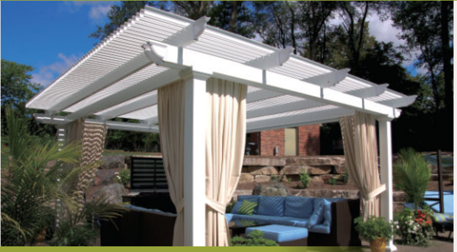
10'x16' Operable (Roof louvers that open & close) – Classic Style – White