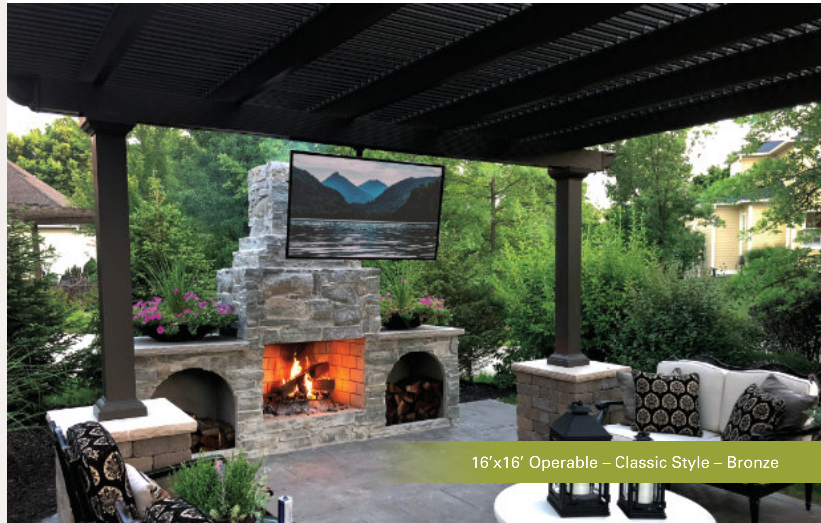
16'x16' Operable – Classic Style – Bronze