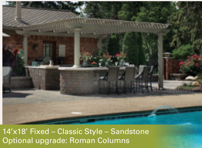
14'x18' Fixed – Classic Style – Sandstone Optional upgrade: Roman Columns