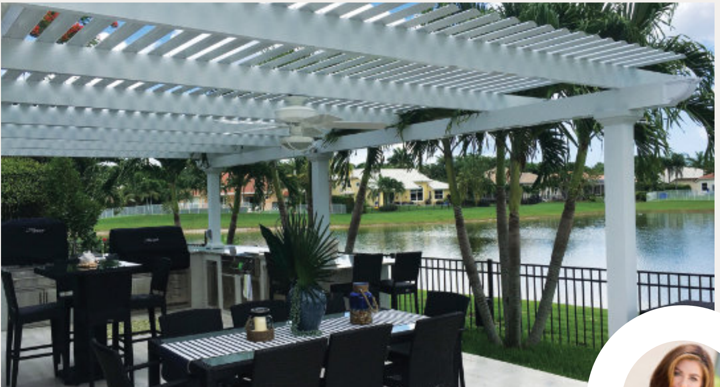
12'x20' Fixed (Roof louvers do not move) – Classic Style – White