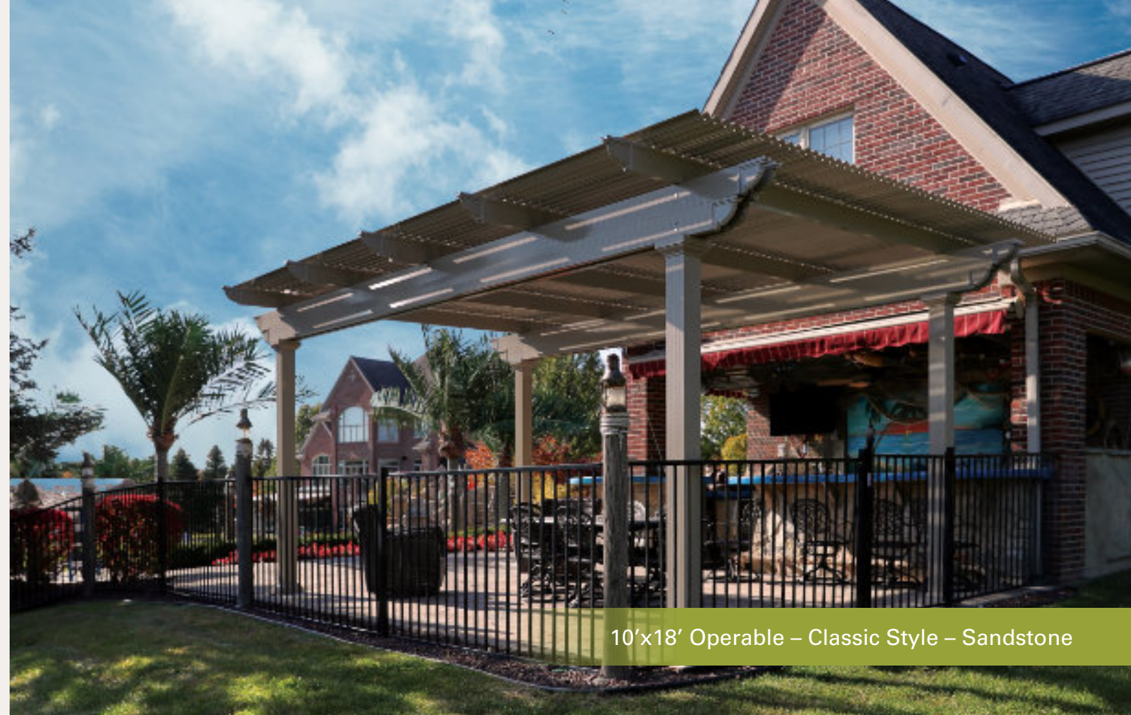
10'x18' Operable – Classic Style – Sandstone