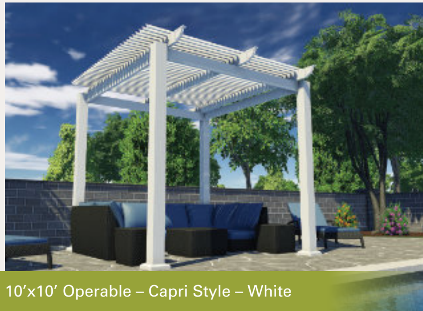
10'x10' Operable – Capri Style – White